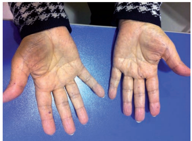
Figure 2 Symmetrical telangiectasic macules are observed in both palms..